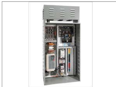
Pixel AC System

The Pixel Control System offers three points of system access - the Machine Room (or Main Controller for MRLs), Cartop, and Car Operating Panel - allowing the most convenient location to be used to complete tasks quickly and easily.