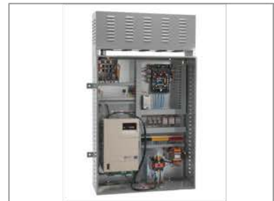
Pixel DC System