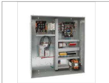
Pixel Hydro System